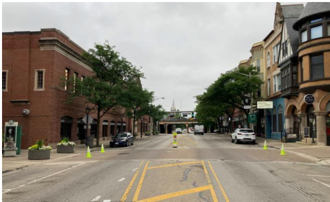
Figure 1. Existing Conditions Oak Park Avenue Facing South Towards North Boulevard

The Hemingway district is the latest business district within Oak Park to develop a streetscape project, making it a highly anticipated project. The sculpture and installations requested will be a part of the Oak Park Avenue Streetscape project, a street rehabilitation and refurbishment of the corridor from Pleasant St. to Ontario St. along Oak Park Avenue. The project will include improvements of the sidewalk, curb, and roadway, as well as improved benches, streetlighting, and outdoor dining areas. The project area, also known as the Hemingway District, houses many businesses, shops, and restaurants. The area has a rich history, and is home to beautiful, historic, and notable architecture.