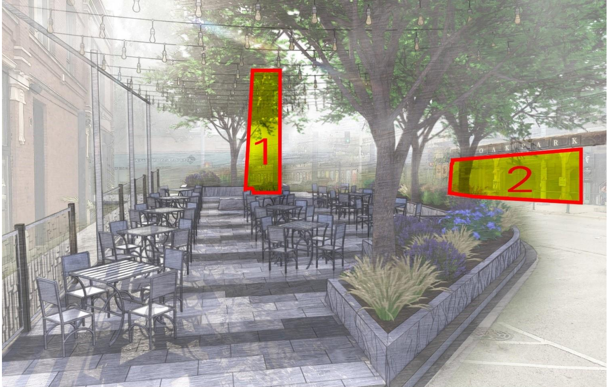
Figure 3. Rendering Showing the Locations of the Two Installations (the Viaduct Installation Will be the Located on the Two Walls on Either Side of the Road)