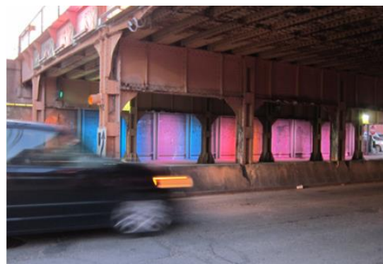
Figure 6. Existing Conditions Oak Park Avenue Viaduct – North Side Facing Southeast