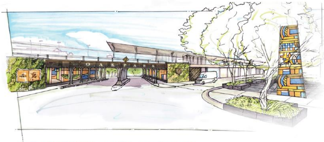
Schematic Design Concept: View Looking North-East from S. Oak Park Avenue and South Boulevard