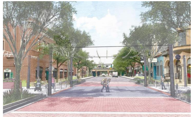
Figure 2. Design Concept Oak Park Avenue Facing South Towards North Boulevard