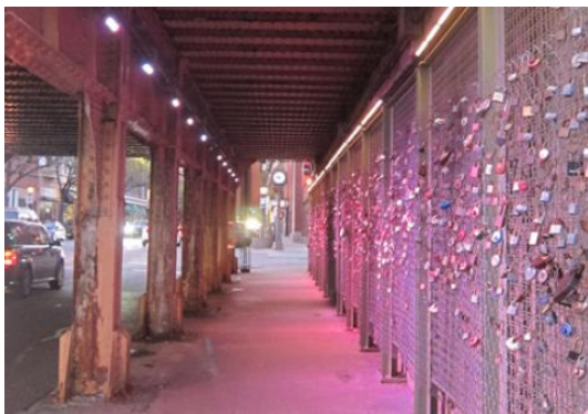
Figure 5. Existing Conditions Oak Park Avenue Viaduct – East Side Facing North